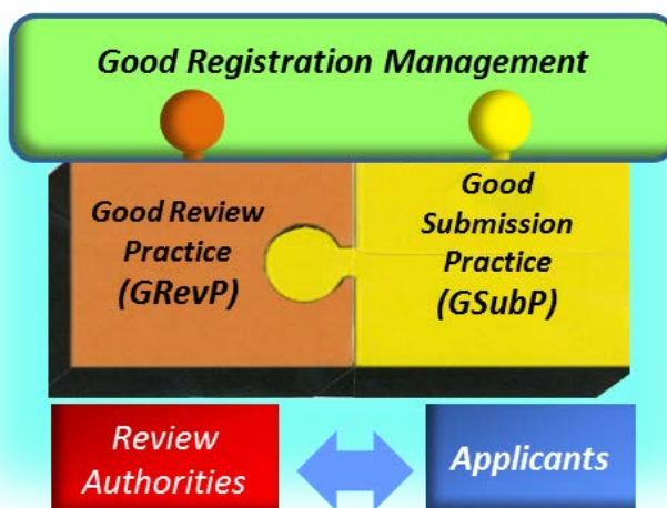
Fig. 1 Concept of GRM